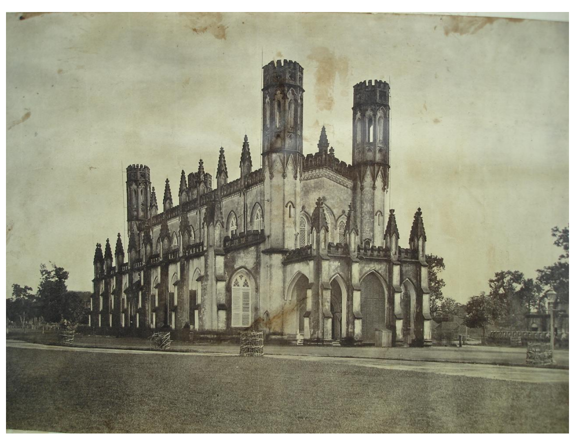
Fort William Church Kolkata, 1866

18 SHARES f Share on Facebook Share on Twitter +