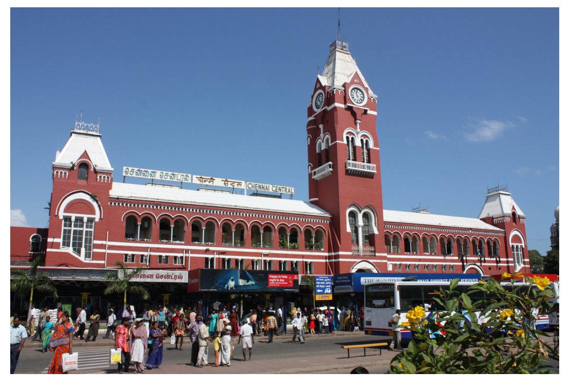
Chennai Central Station

New Delhi is a classic example of early 20<sup>th</sup> century colonial architecture. Sir Lutyens along with a group of architectures designed the main central administrative district of the city that till date stands and houses important buildings and residences of the political and administrative importance.