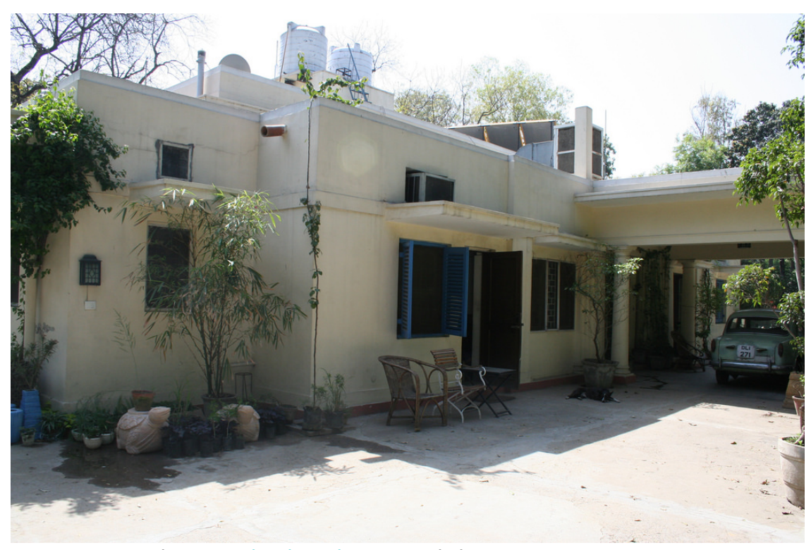
Lutyens Bungalow

Over the years the names of many of the colonial structures have been changed to give them an Indian tone, however, the structure itself bears testimony to its period and age of construction. The British colonial era is a reality of the Indian subcontinent history and its architecture is an important and integral part of the nation's past and present.