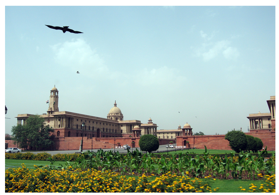
Parliament Delhi

British colonial architecture hence came into the picture the very instant that the British set shop in India. But over the years, the architectural styles evolved. From what started out as an all-out endeavor to mark superiority slowly changed into accepting and acknowledging the 'Indian way'.