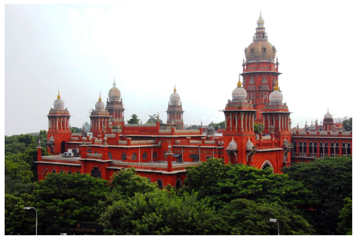
Madras High Court an example of Indo Saracenic architecture

stations, rest houses, government buildings and so on. The Rajabai Clock Tower, Victoria Terminus, Bombay High Court in Mumbai and the grand Victoria Memorial in Kolkata are some of the many notable structures built during the late 19<sup>th</sup> century.