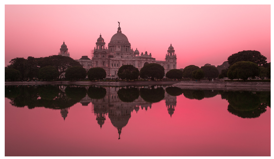
Victoria Memorial Kolkata

So what does this really make us? What does it mean to know that though we are an independent nation, our strongest infrastructure and architectural planning have been given to us from the same regime that we tried to wade off for generations?